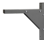
HV-2 ; 22" reach HV-3 ; 25" reach